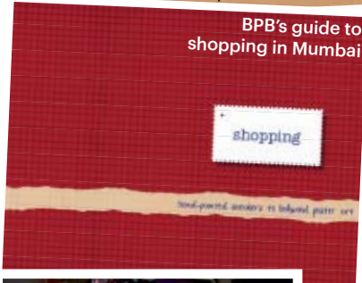
BPB's guide to shopping in Mumbai