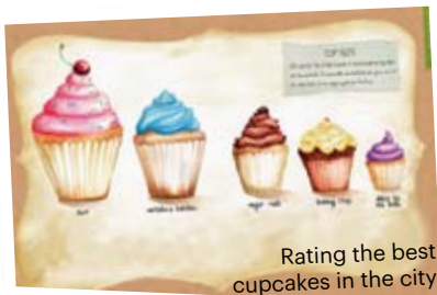
Rating the best cupcakes in the city

Compiled by Juhi Baveja and Sheetal Raghav