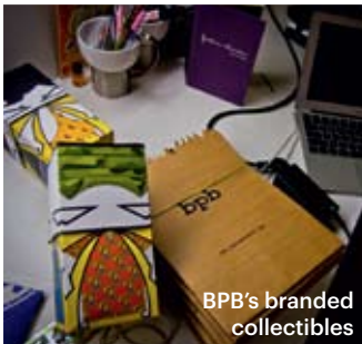
BPB's branded collectibles