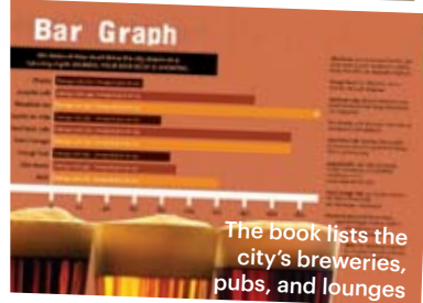
The book lists the city's breweries, pubs, and lounges